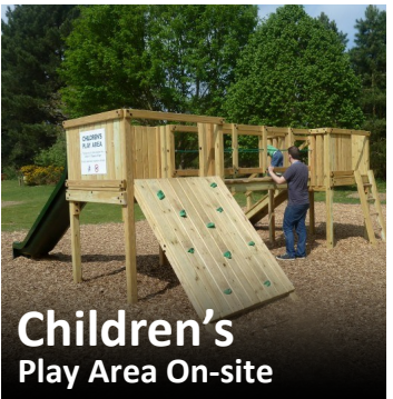
Children's Play Area On-site

Call to book 01394 450707 http://www.forestcamping.co.uk admin@forestcamping.co.uk